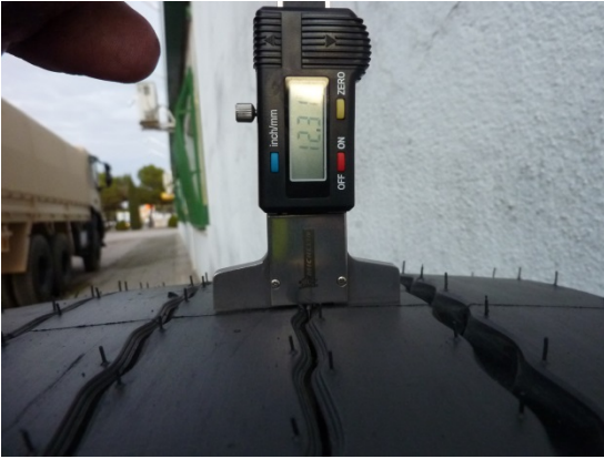
Measuring tread depth in the narrow central grooves on this new tire shows a tread depth of 12.31 mm or 15/32 inch.

STEP 8: Repeat STEPS 3-7 across the tread face at the other main circumferential grooves.