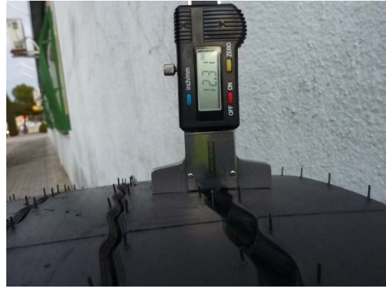
Measuring tread depth in the fully open shoulder grooves on this new tire confirms the same depth of 12.31 mm or 15/32 inch.

In some cases, inspectors may falsely believe that hidden, rain drop features do not meet the minimum tread depth requirement. In fact, these grooves are of full depth and are open from the first mm or 32 nd of an inch to the last. This can be verified with a simple tread depth gauge at all points in the tire's life. There are currently no tread groove minimum width (only depth) requirements in North America.