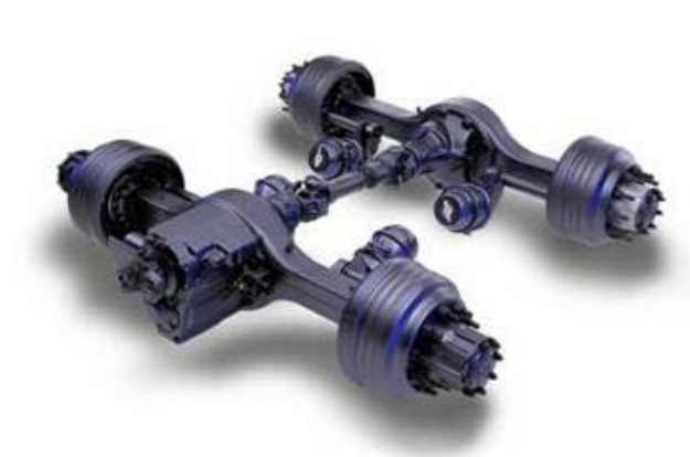
6 x 4 Driveline System (Figure 1)

The typical three-axle tractor is considered a 6 x 4 system (Figure 1). This means that there are six wheel ends with four of those wheel ends potentially supplying power to the ground, meaning you have two drive axles. An advanced 6 x 2 system (Figure 2) has the same six wheel ends but will only have two that supply power to the ground, meaning there will be only one drive axle. The other axle is considered a non-drive axle and will either have a normal axle with all driveline components (i.e., driveshaft, gears within the differential) removed or it will be a solid axle with no differential housing. In either case, this axle will not provide any traction assistance propelling the vehicle. The non-drive axle can be in either axle location but is typically in the rearmost position.