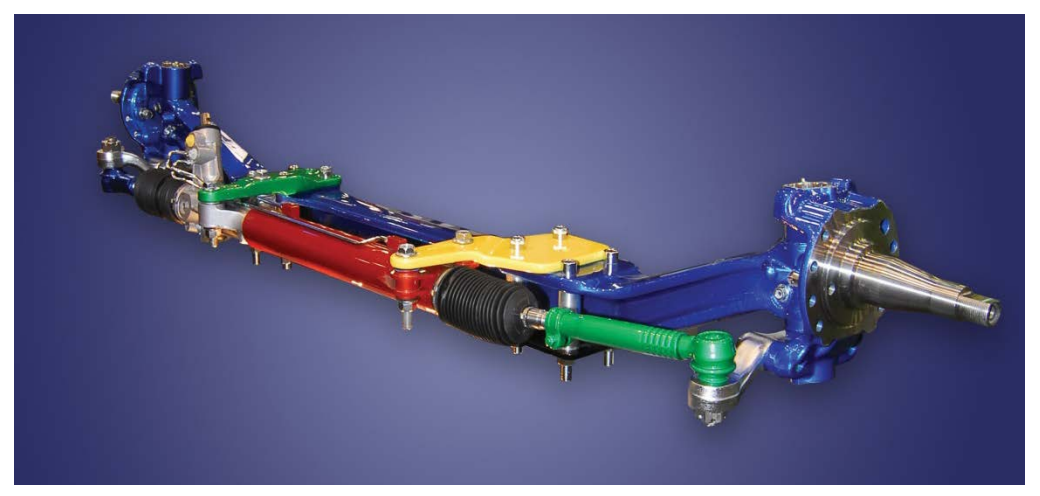
© 2019 Commercial Vehicle Safety Alliance All rights reserved.